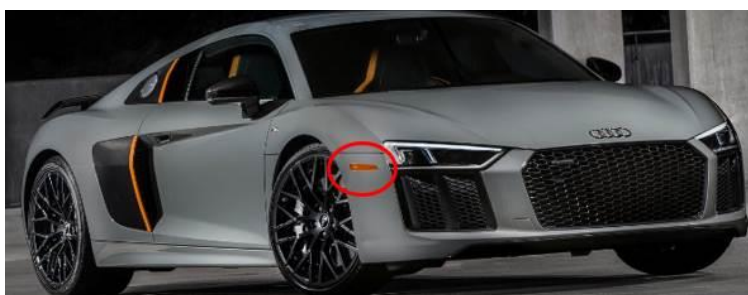
Figure 1. Front side marker light.

Only the front side marker lights are affected (Figure 1) with part number: 4S0-945-071/4S0-945-072.