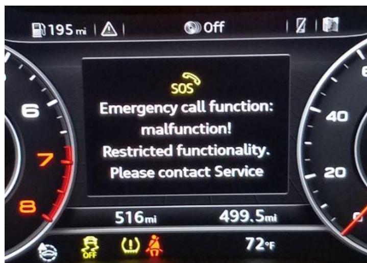
Figure 1. Warning message "Emergency call function: malfunction!"

A sporadic or permanent warning message appears in the driver information system (DIS) (Figure 1).