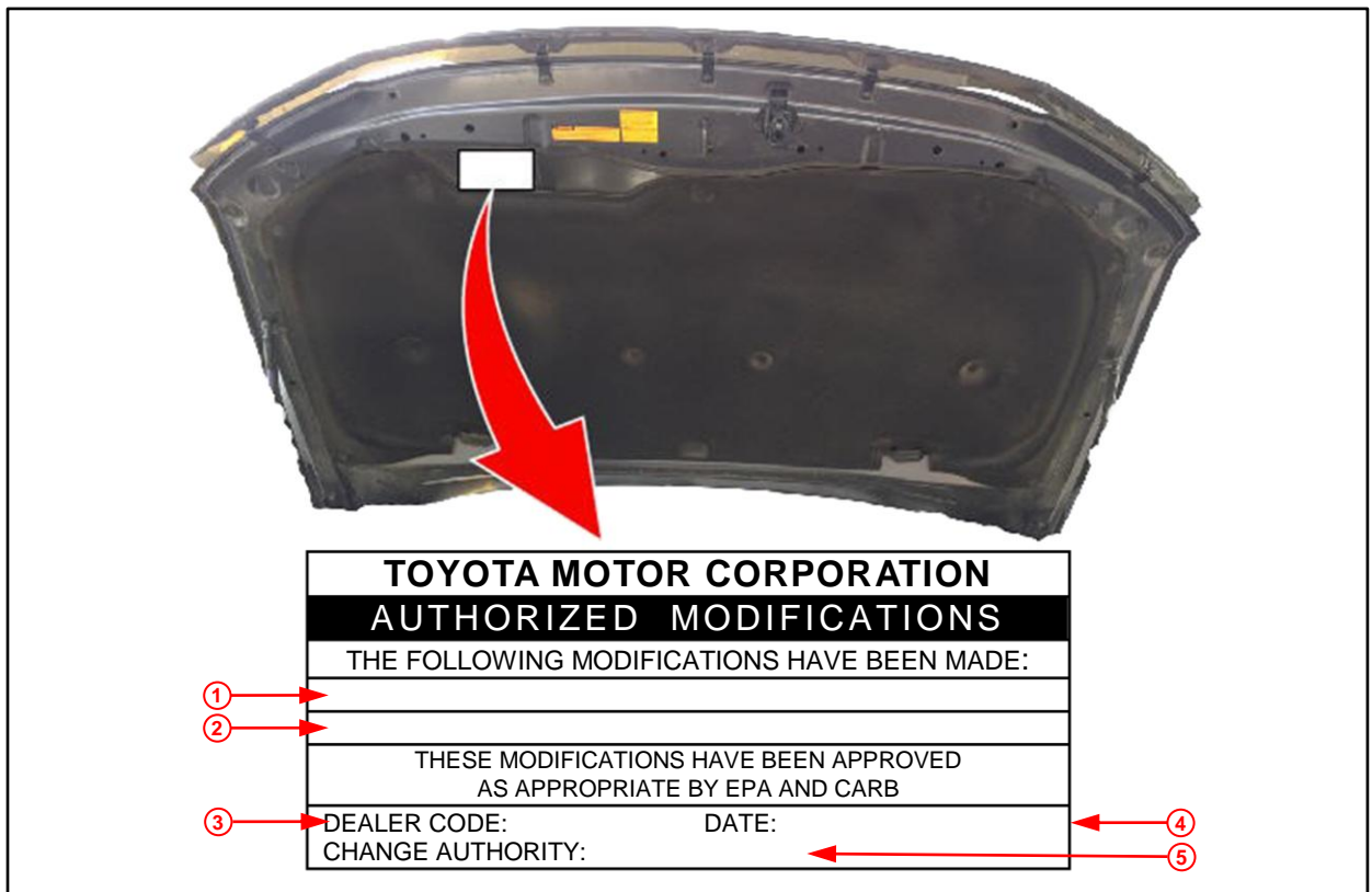
Figure 1. Location of Authorized Modification Label for 2016 LX 570