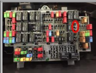
Figure 2: Cab PDM location of Relay 5 in 1015 B6