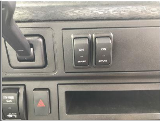
Figure 1: Switches, including Auxiliary Switch