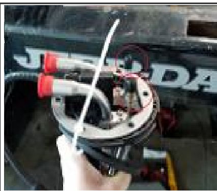
Figure 5: DEF tube orientation of 5/15 gallon ultrasonic sensor