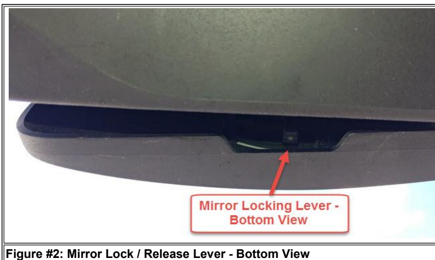
Figure #2: Mirror Lock / Release Lever - Bottom View

2. With the mirror installed in the housing, you can access the locking lever through the bottom of the mirror by tilting the top of the mirror inward (Figure #2).