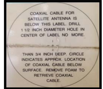
Label to be removed

Winnebago Industries is conducting a Field Service Campaign to remove the satellite cable locating label (pictured at right) from the roof of certain 2017 and 2018 View/Navion coaches. The label was inadvertently installed in the wrong location and will need to be removed to prevent damage to the roof if someone were to attempt to install a satellite dish in this location.