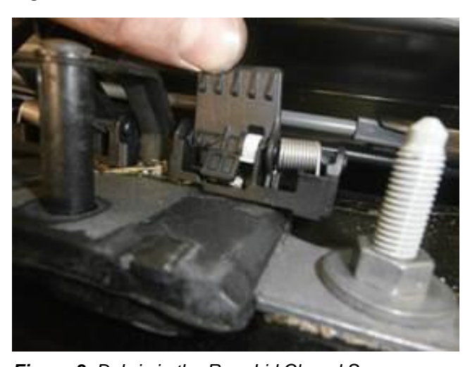
Figure 3. Debris in the Rear Lid Closed Sensor.

Mounted to the base of the rear lid striker is the G525/G526 Rear Lid Closed Sensor. Due to its position, debris that enters the striker housing can get caught in the switch mechanism and cause incomplete switch actuation (Figure 3).