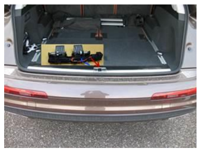
Figure 2. Rear Lid Closed Sensor.

This condition may be caused by incomplete actuation of the Rear Lid Closed Sensor G525/G526 due to debris in the switch mechanism (Figure 2).