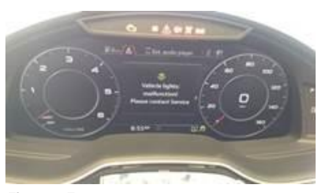
Figure 1. Error message.

The following DTC may be stored in the comfort system central control module, J393 (address 0046):