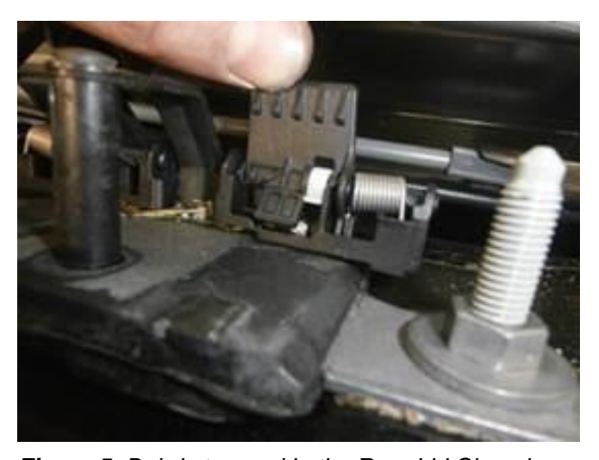
Figure 5. Debris trapped in the Rear Lid Closed Sensor.

2. Blow out any debris that might be causing an obstruction with compressed air (Figure 5).