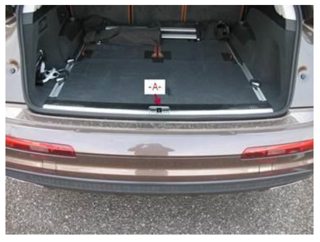
Figure 4. Striker cover opening.

1. Press down the striker cover on the loading sill cover -A- (Figure 4).