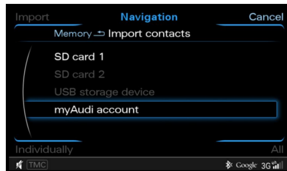
Figure 3. Importing contacts from the myAudi account.