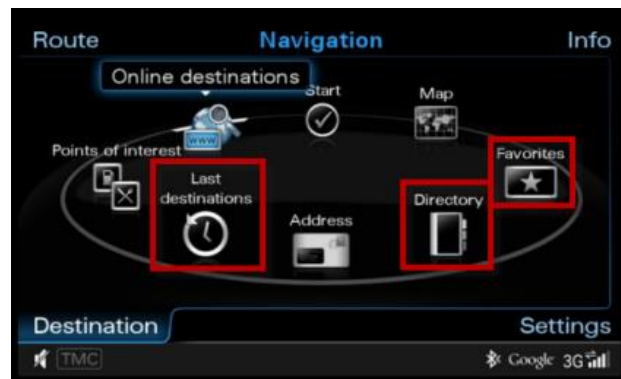
Figure 1. Navigation >> Favorites , Navigation >> Directory , and Navigation >> Last destinations submenus.