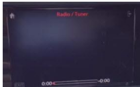
Figure 1. Unplayable tutorial video.