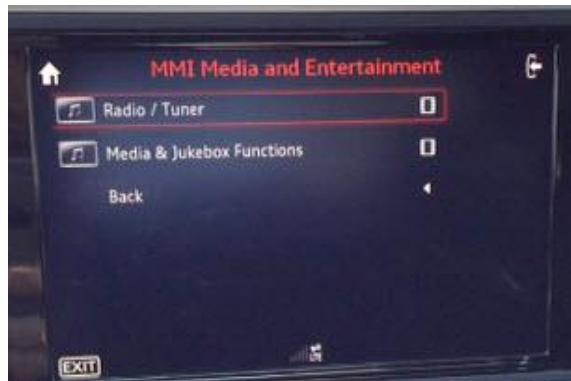
Figure 2. Incorrect video files.

The incorrect video files are “Radio / Tuner” and “Media & Jukebox Functions” (Figure 2).