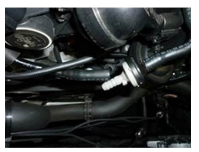
Figure 1. Vacuum check valve.

If a leak is found at the check valve, replace the valve and recheck.