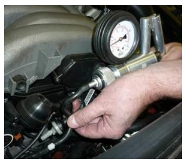
Figure 2. VAS 6213 hand vacuum pump.

3: Vacuum reservoir in inner valley of engine 0.7 l)