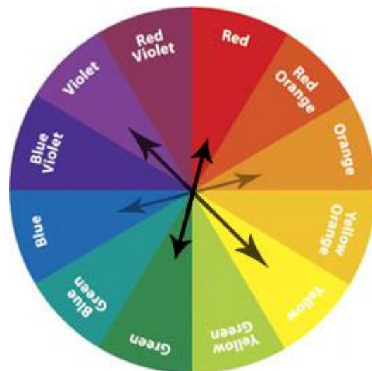
Figure 2. Complementary color wheel.

In certain lighting conditions, the system responds to vibrant nearby colors (from the vehicle or other objects) by automatically adding a complementary color (Figure 2) to rebalance toward white, which can lead to color deviations. For example, a red object can cause the system to add a green hue. The strength of the added color depends on the brightness of the object and the ambient light.