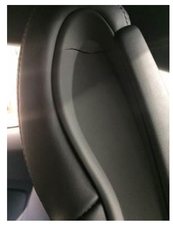
Figure 3. Front seat side trim cracked.