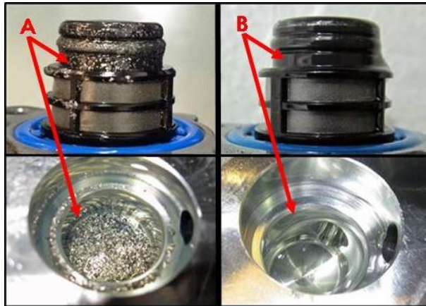
Figure 2. Fuel metering valve and valve bore with metallic particles (A), and without metallic particles (B).