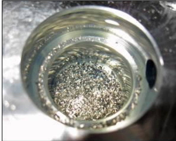
Figure 4. Example of a clear picture showing the metallic particles in the valve bore.