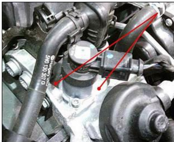
Figure 1. Area surrounding the valve.

Fuel system components may be damaged if any debris enters the fuel system.