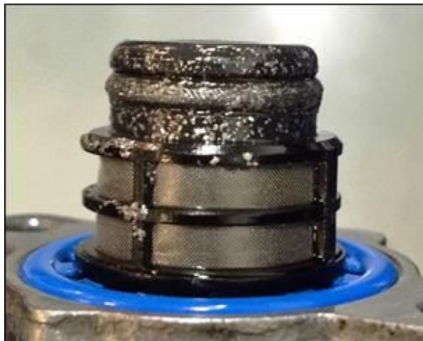
Figure 3. Example of a clear picture showing the metallic particles in the N290 fuel metering valve.