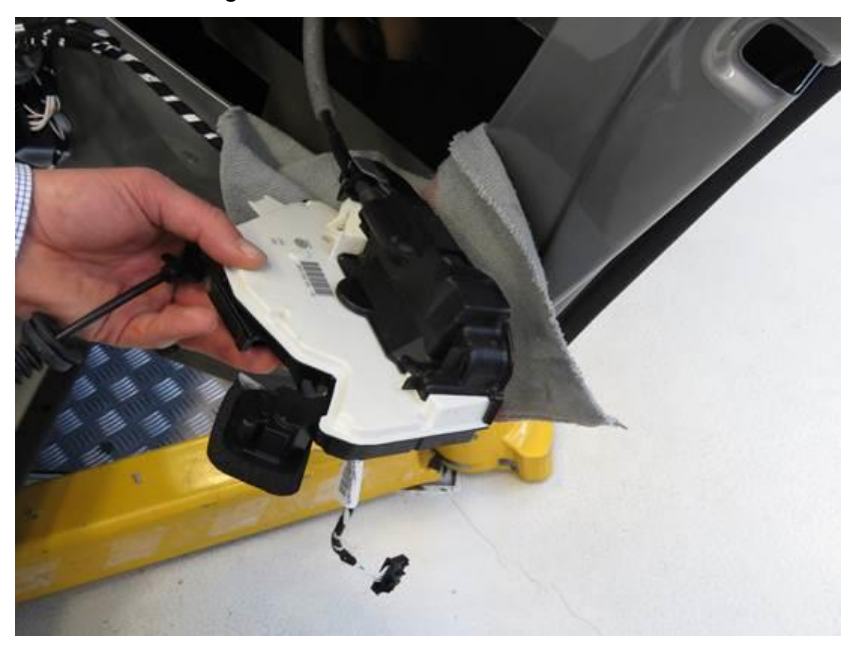
Figure 1) door lock and cap assembled