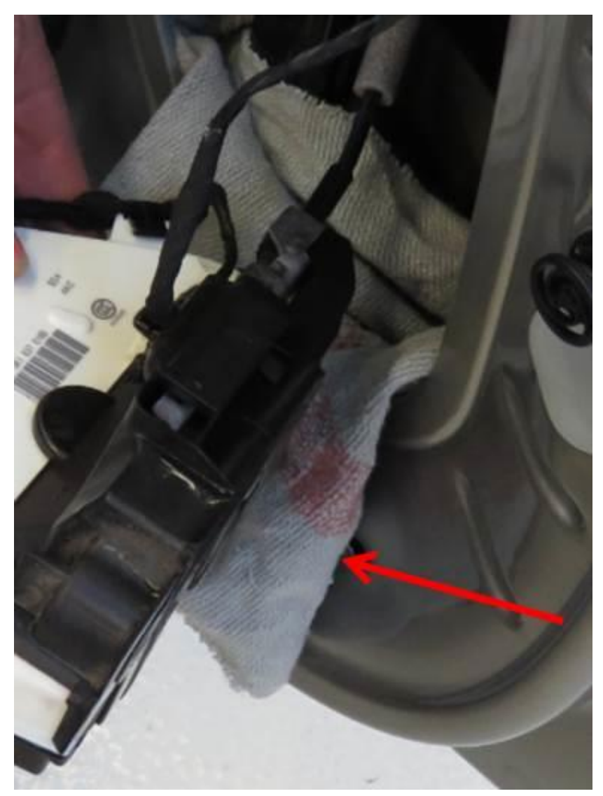
Figure 2) example of protected lower door area

Using shop rags or suitable material, protect the lower section of the door against damage as shown in Figure 2.