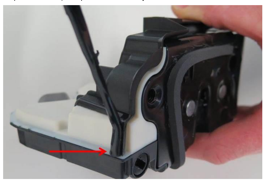
Figure 3) starting position for routing Butyl sealing cord

• Carefully route the butyl sealing cord, starting from position 1 (Figure 3, red arrow), along the cap (Figure 4, position 1 to 5) and press it down firmly.