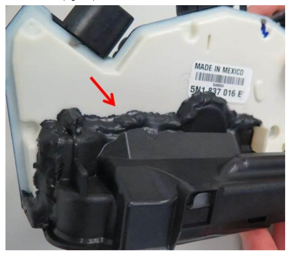
Figure 6 (example: butyl sealing cord pressed down/spread out by hand

Press down again on the Butyl sealing cord (spread the Butyl) to ensure proper sealing between the cap and the door lock (Figure 6).