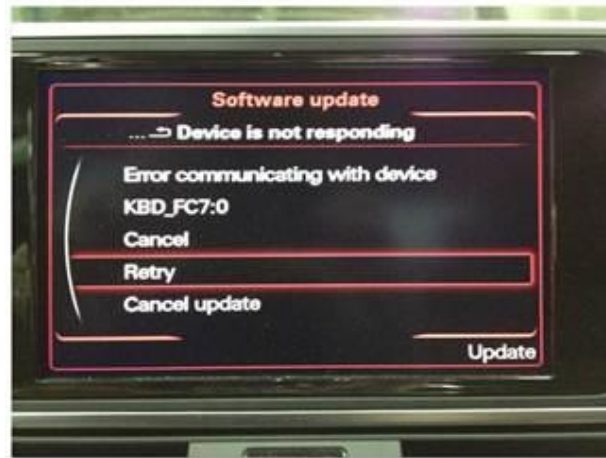
Figure 6. A device requiring a 'Cancel' selection.

Some earlier model year 2012 vehicles, or vehicles equipped with Bose® sound systems may experience certain modules that will not update properly during Step 16 of TSB 2028141. If this should occur, either choose 'Cancel' (Figure 6), or 'Skip device' (Figure 7), depending on the type of error. Do not choose 'Cancel update', as this may cause the software update to fail entirely. After the update is finished and the summary page is shown, select 'Retry' at the bottom of the list if it is available to attempt to update the modules again. If 'Retry' is greyed out, then the software update was successful. Select 'Continue' to proceed. In some cases 'Retry' may have to be repeated two or three times to get all modules to update successfully.