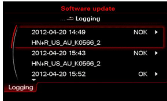
Figure 9. Software update log showing 2 failed attempts before a successful installation.

Tip: If the update must be performed two or more times due to modules not updating correctly, a screenshot of the software update log is required (Figure 9). This should be kept on-hand for warranty auditing purposes. To take a screenshot, insert an SD Card into slot 1. For A6/A7/A8/Q7, press and hold the left and right arrow keys at the same time. For A4/A5/Q5, press and hold the bottom two softkeys at the same time. All 4 softkeys will flash when the screenshot is taken. A screenshot should be taken of each page in the logging display.