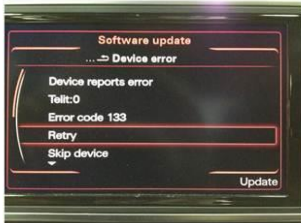
Figure 7. A device requiring a 'Skip device' selection.