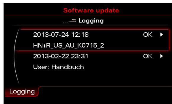
Figure 8. Software update log showing a successful software installation.