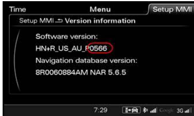
Figure 1. Example showing MMI software version (0566).