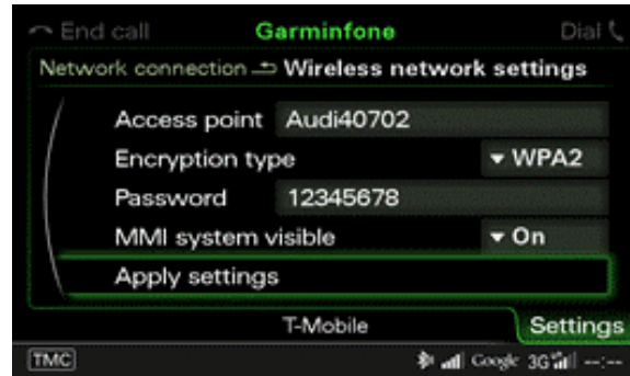
Figure 5. Wireless network settings.

6. As part of the update, wireless settings and paired devices will be deleted. All devices will need to be re-paired after the update, and all wireless settings restored to the customer's settings. To access the Wireless network settings on the MMI (Figure 5), press TEL >> Settings >> Wireless network connection >> Wireless network settings . Record all settings so they can be re-entered at the end of the update.