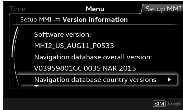
Figure 2. MMI Version Information.