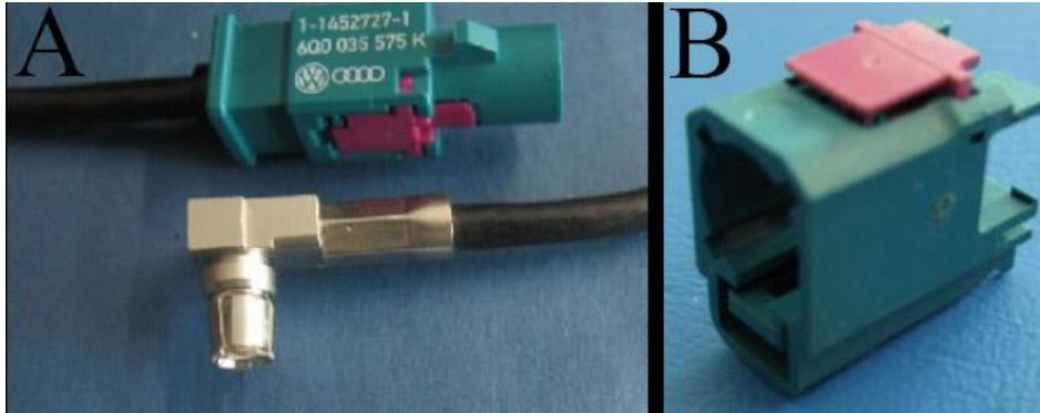
Figure 5. A: Adapter antenna cable 000098691. B: 4E0035674K Connector housing for angled-antenna-bush-plug.