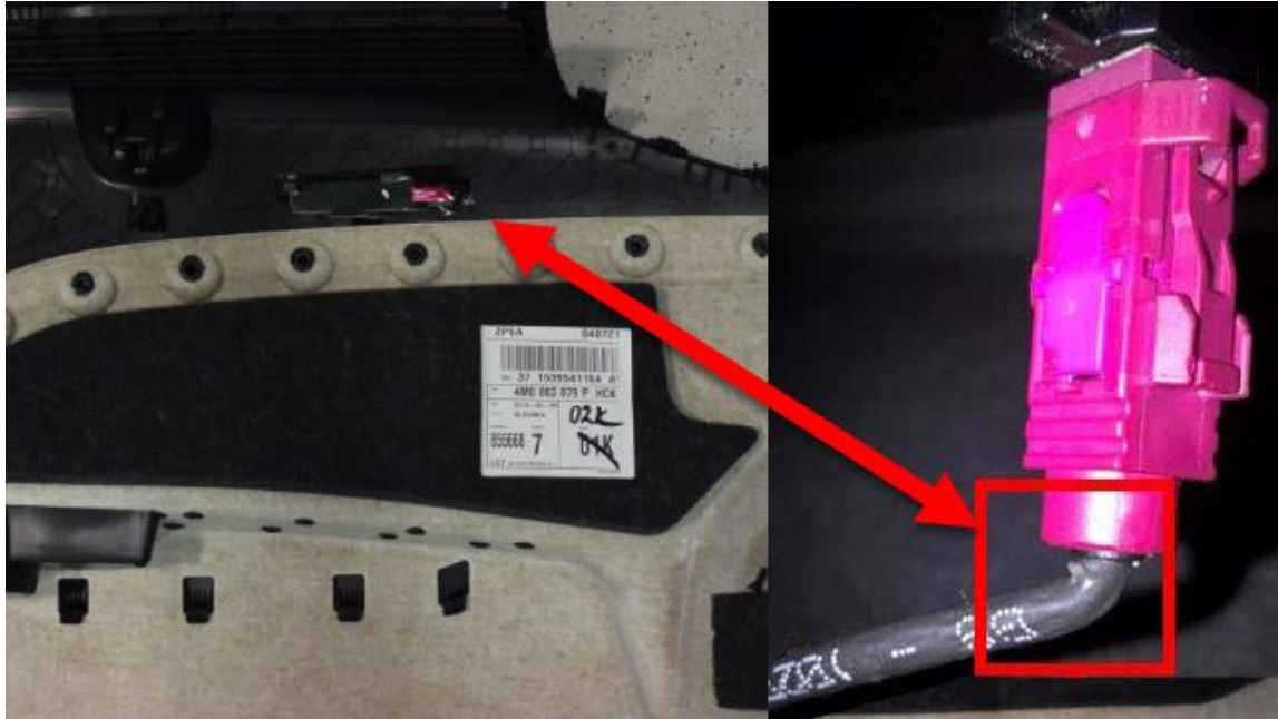
Figure 2. Coaxial wire kinked at R263 SOS Antenna.