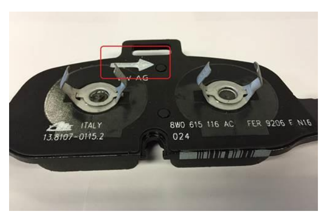
Figure 4. Arrow showing correct installation direction.