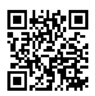
Figure 1. QR code for viewing the video with a QR code reader on phones and tablets. Alternatively, the video can be accessed through computer internet browsers at the link provided in this bulletin.

A clicking noise is heard from front brakes when the vehicle is being driven at low speeds (up to 10 mph) in either direction. For an example of the sound, see the video located at: https://audi-external.kzoplatform.com/swf/player/322 (Figure 1).