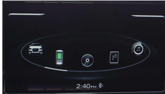
Figure 2. MMI main menu missing text.