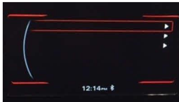
Figure 1. MMI car menu missing text.