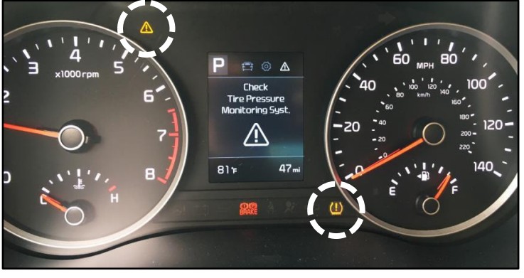
Type B cluster.