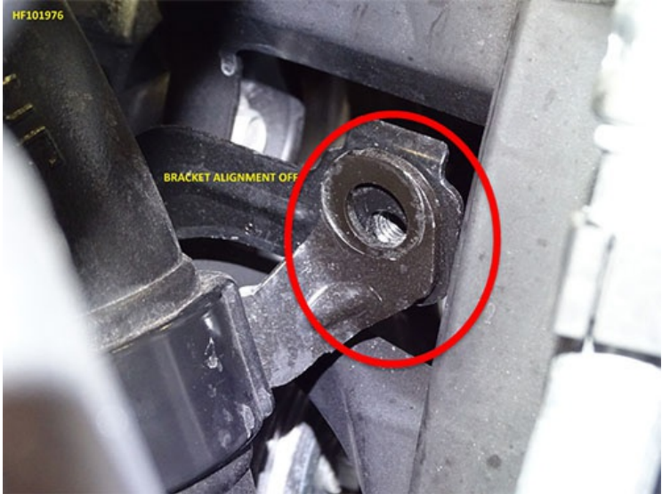
Mis-aligned charged air cooler pipe bracket and bolt hole after the charge air cooler outlet hose is connected properly to the throttle body.

If P2463 was not set and a charge air cooler leak or disconnect was found, after repairing charge air cooler connections, command Diesel Particulate Filter (DPF) Regeneration Enable with the scan tool before returning the vehicle to the customer.