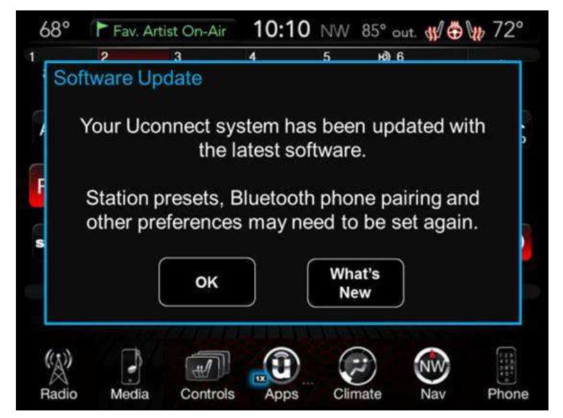
Fig. 5 Confirmation Screen

5. Upon completion of update, the radio will display a confirmation message (Fig. 5) .