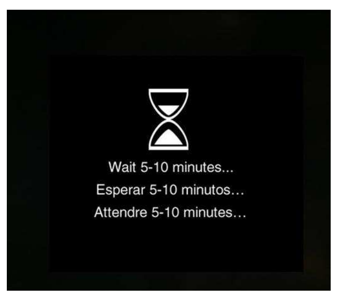
Fig. 3 Wait Screen

3. The "wait" screen (Fig. 3) will appear multiple times during the update.