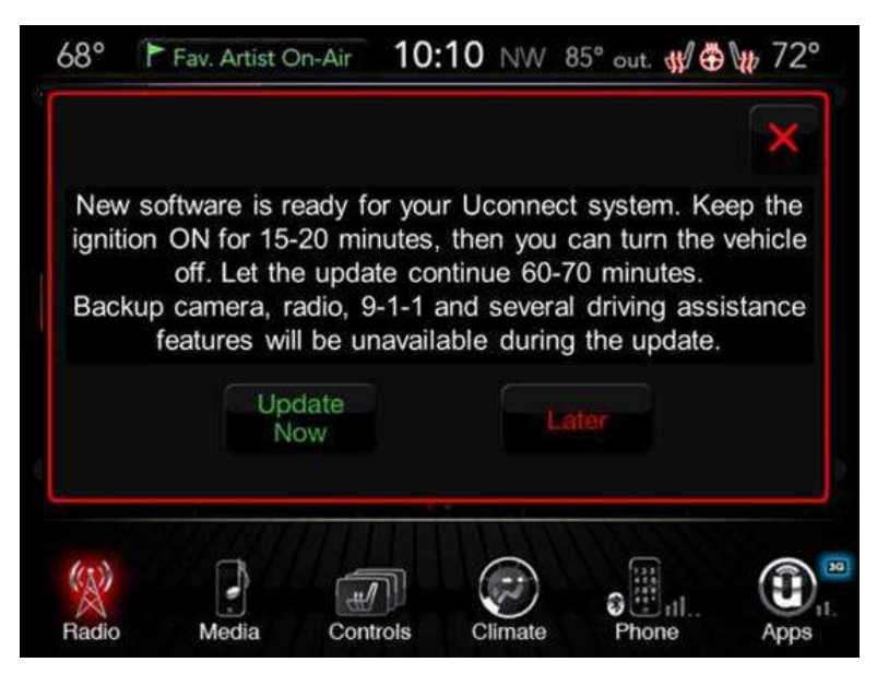
Fig. 1 Software Acceptance Screen

1. The vehicle needs to be in the park position, or have the vehicle in neutral with parking brake engaged if equipped with a manual transmission. The engine does not need to be running, however, the ignition must be in the "RUN" position (On).