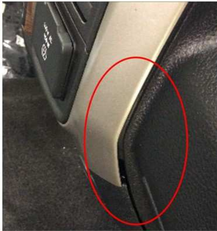
Fig. 1 Gap at Center Stack Trim

The customer may notice a large gap where the center stack meets the instrument panel (Fig. 1) .