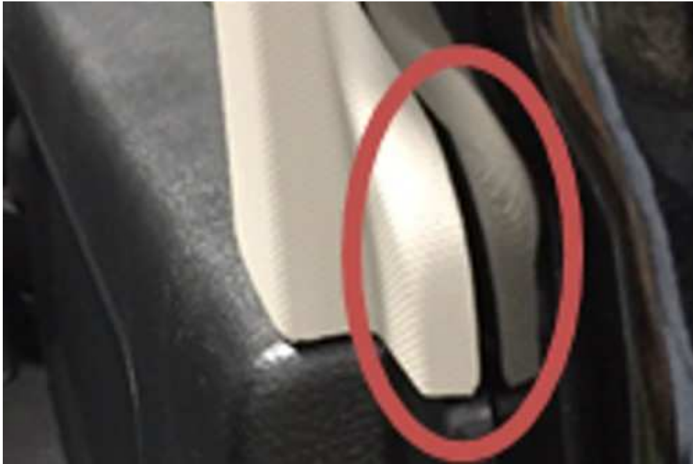
Fig. 1 Gap Identified at Door

The customer may notice the glass cover trim is loose or shows a gap on either of the rear door (Fig. 1) .