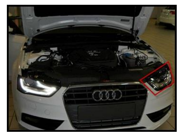
Figure 1. Driver's side LED DRL inoperative.

The LED daytime running light in a single headlight does not work (Figure 1). The issue must be repeatable at the workshop.