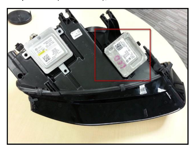
Figure 3. Daytime Running Lamp and Parking Lamp control module (DRL control module), J860/J861

Additionally, water can enter through an adjustment screw at the top of the headlight, causing damage to the Daytime Running Lamp and Parking Lamp control module (DRL control module), J860/J861 (Figure 3).