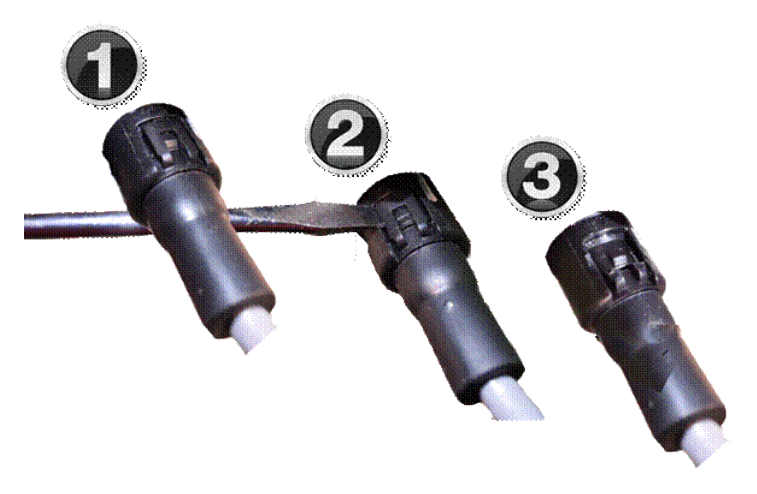
Figure 3. Locate locking tab (1), lift up on tab with screwdriver (2), snap tab off (3).

5. Carefully install the new reverse camera harness onto the camera assembly, as the harness can only be installed one way. The connector is keyed on both the camera and the electrical harness to prevent incorrect installation. Ensure they are correctly aligned during installation (Figure 4).