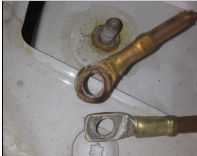
Figure 2 – Example of corrosion on ground point

Dr. Ing. h.c. F. Porsche AG is the owner of numerous trademarks, both registered and unregistered, including without limitation the Porsche Crest®, Porsche®, Boxster®, Carrera®, Cayenne®, Cayman®, Macan®, Panamera®, Speedster®, Spyder®, Tiptronic®, VarioCam®, PCM®, PDK®, 911®, RS®, 4S®, 718®, 918 Spyder®, FOUR UNCOMPROMISED®, and the model numbers and distinctive shapes of the Porsche automobiles such as, the federally registered 911 and Boxster automobiles. The third party trademarks contained herein are the properties of their respective owners. Porsche Cars North America, Inc. believes the specifications to be correct at the time of printing. However, specifications, standard equipment and options are subject to change without notice. Some options may be unavailable when a car is built. Some vehicles may be shown with non-U.S. equipment. Please ask your authorized Porsche dealer for advice concerning the current availability of options and verify the optional equipment that you ordered. Porsche recommends seat belt usage and observance of traffic laws at all times.