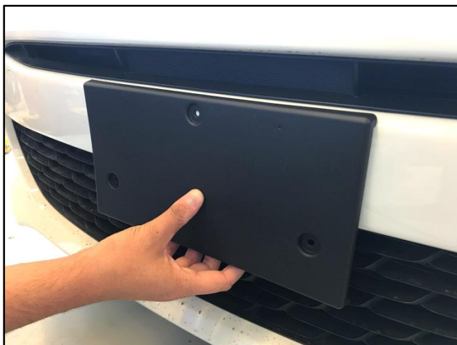
Bottom of bracket is not flush with the bottom of garnish and bottom holes of the bracket are not aligned with garnish dimples.