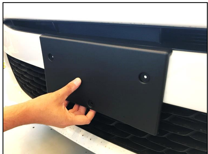
Bracket is upside down.