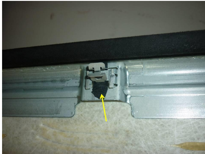
Figure 3. Clips reinstalled.