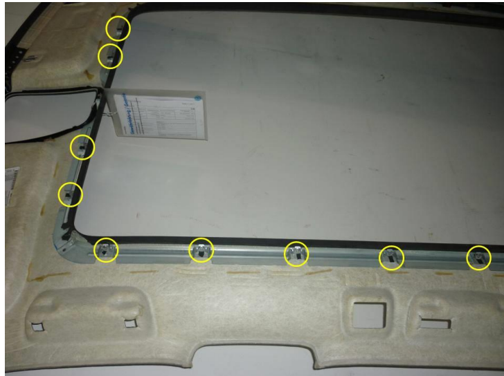
Figure 1. Location of the headliner to sunroof frame clips.