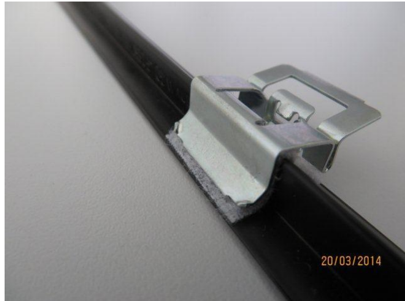
Figure 4. Retaining clip isolated with the fleece tape.