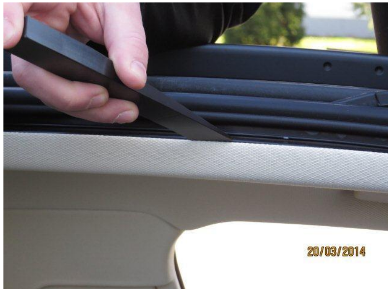
Figure 1. Unclipping the sunroof cover trim frame.