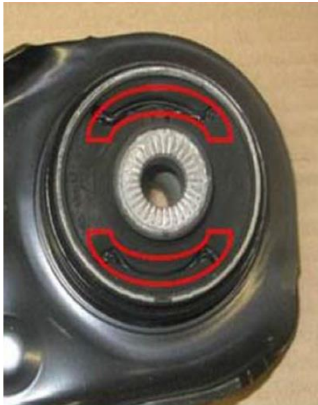
Figure 3. Lithium grease is applied on the red highlighted area only.

Note that the lithium grease must only be applied to the areas shown in red (Figure 3).