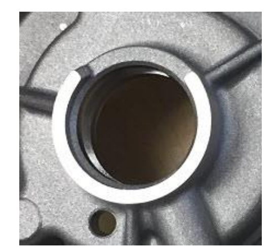
Figure 2. Original Part 06H 103 144 J.