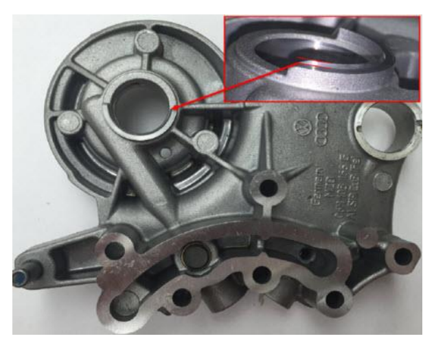
Figure 1. Worn thrust surface.

On some MY 2016 and 2017 vehicles equipped with 2.0TFSI engines, engine codes (CPMB, CAED or CCTA), DTC P001600 can be set due to a worn intake side - camshaft bearing bridge thrust surface (Figure 1).