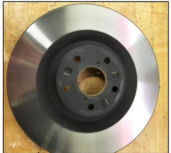
Figure 2. After (Steel)