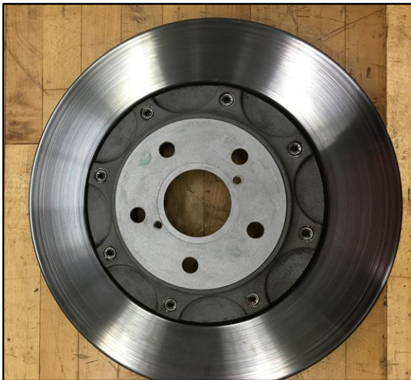
Figure 1. Before (Aluminum)