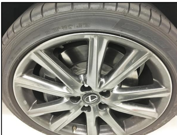
Figure 3. Before* (Aluminum)