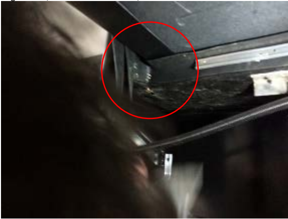
Figure 1 (LEFT HAND SIDE)