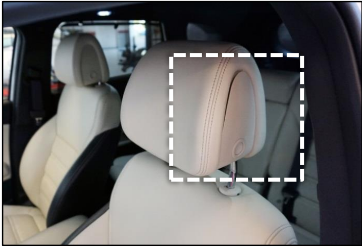
Front Seat Headrest Trim Piece Detachment

To enhance customer satisfaction, this bulletin outlines the replacement of BOTH front seat headrests to resolve the concern, even when only one side is affected.