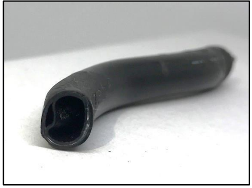
Restricted Fuel Line