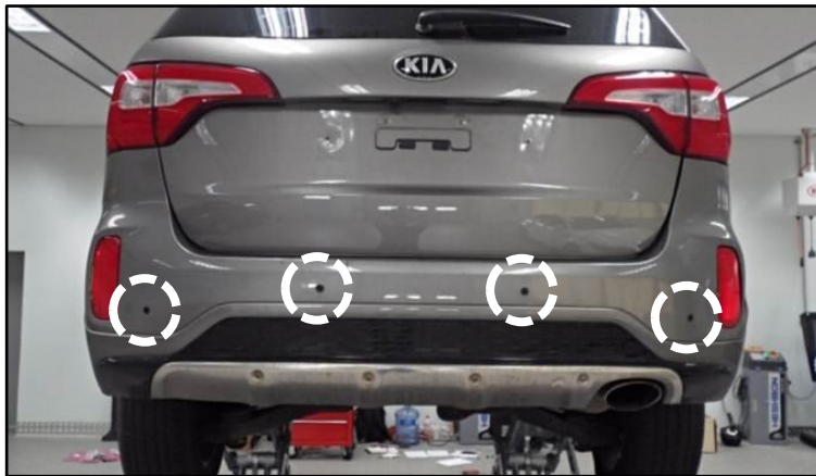
Backup Warning Sensors

To enhance customer satisfaction, this bulletin outlines the replacement of ALL four (4) backup warning sensors, even when only one sensor is affected.