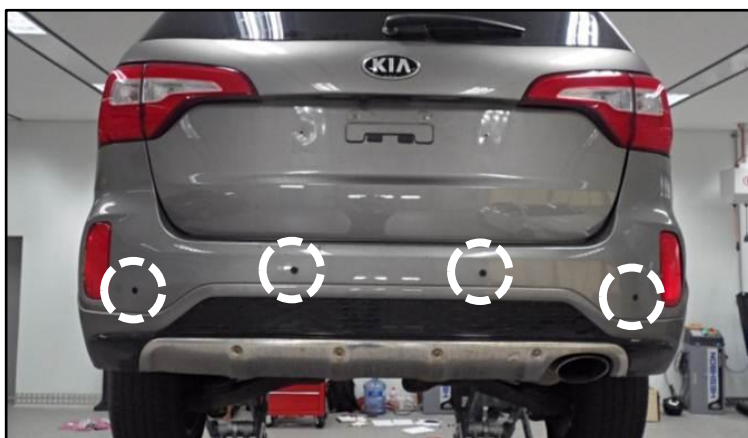
Backup Warning Sensors

To enhance customer satisfaction, this bulletin outlines the replacement of ALL four (4) backup warning sensors, even when only one sensor is affected.