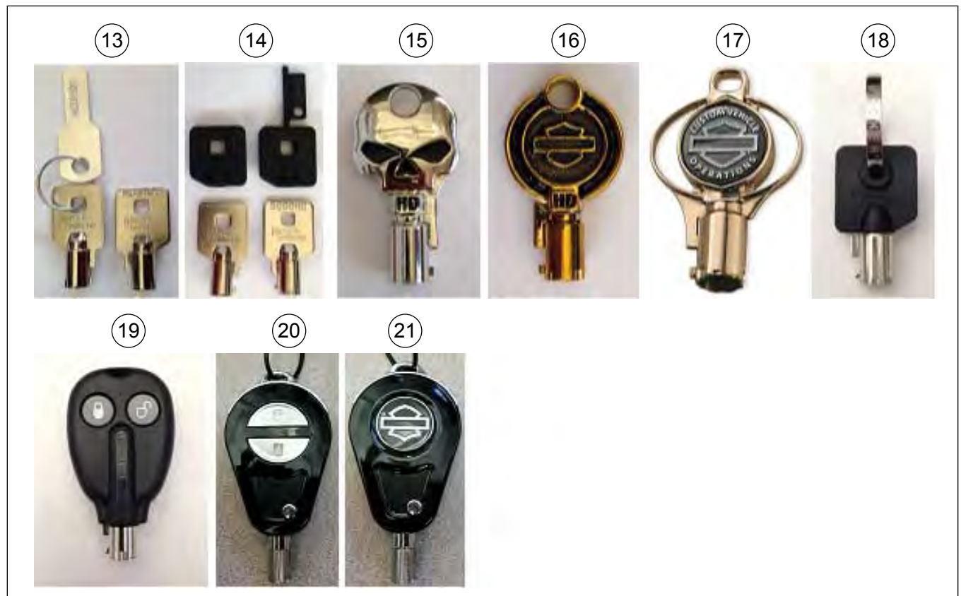
Figure 6. KEYS - BARREL STYLE