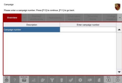
Programming code input field