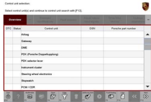
Control unit selection