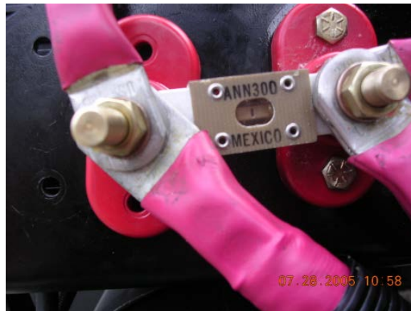
Example of 300 Amp Fuse