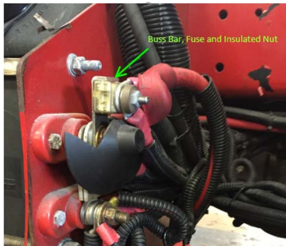
Example of Typical Fuse Installation