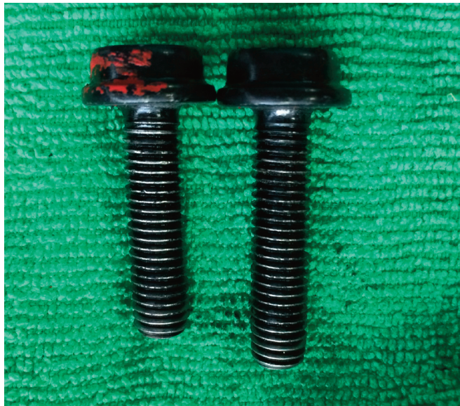
Figure 1: Short (left) and standard length (right) M8 Fasteners.

Information: Three early vehicles in the North American market require special attention during installation of the M8 bolts securing the torque plate at the rear of the vehicle. On these three vehicles only, two of the eight M8 bolts securing the torque plate at the rear of the vehicle are intentionally a few millimeters shorter and must always be reinstalled in exact locations during reassembly (see Figure 1).