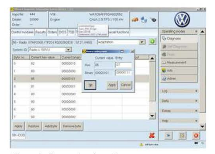
Figure 4. Changed radio coding.