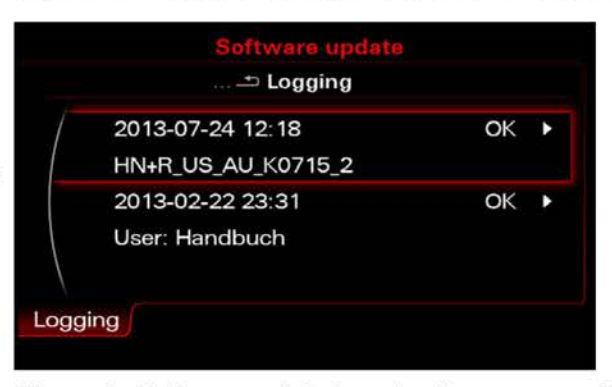
Figure 8. Software update log showing a successful software installation.

Tip: If the update must be performed two or more times due to modules not updating correctly, a screenshot of the software update log is required (Figure 9). This should be kept on-hand for warranty auditing purposes. To take a screenshot, insert an SD Card into slot 1. For A6/A7/A8/Q7, press and hold the left and right arrow keys at the same time. For A4/A5/Q5, press and hold the bottom two softkeys at the same time. All 4 softkeys will flash when the screenshot is taken. A screenshot should be taken of each page in the logging display.