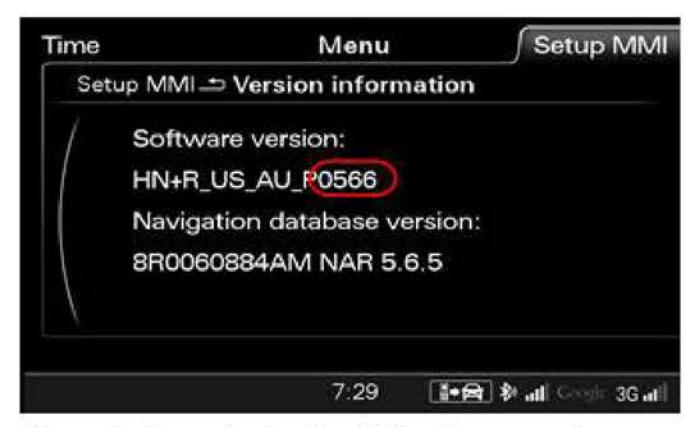
Figure 1. Example showing MMI software version (0566).

Tip: Only apply this bulletin to vehicles if the customer complaint is in the correct group. Applying the update to vehicles outside of the appropriate group can cause repeat repairs and the warranty claim may be denied.