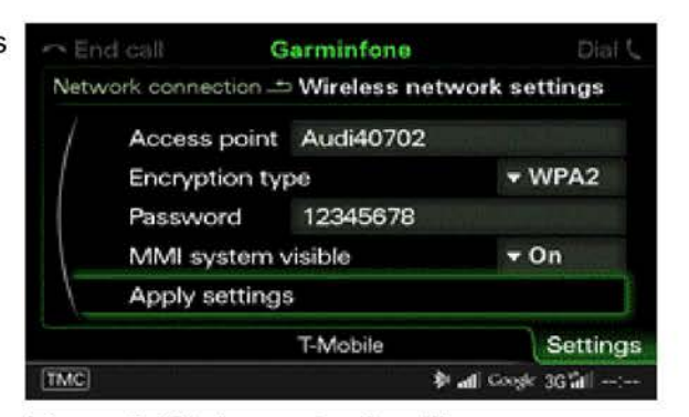
Figure 5. Wireless network settings.