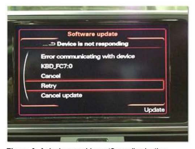
Figure 6. A device requiring a 'Cancel' selection.

Some earlier model year 2012 vehicles, or vehicles equipped with Bose® sound systems may experience certain modules that will not update properly during Step 16 of TSB 2028141. If this should occur, either choose 'Cancel' (Figure 6), or 'Skip device' (Figure 7), depending on the type of error. Do not choose 'Cancel update', as this may cause the software update to fail entirely. After the update is finished and the summary page is shown, select 'Retry' at the bottom of the list if it is available to attempt to update the modules again. If 'Retry' is greyed out, then the software update was successful. Select 'Continue" to proceed. In some cases 'Retry' may have to be repeated two or three times to get all modules to update successfully.