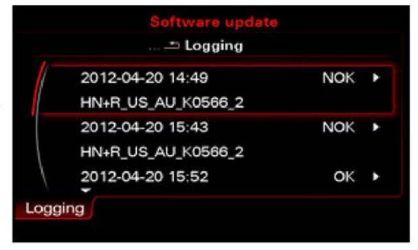
Figure 9. Software update log showing 2 failed attempts before a successful installation.