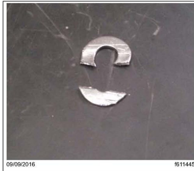
Fig. 3, Trimmed #10 Washer