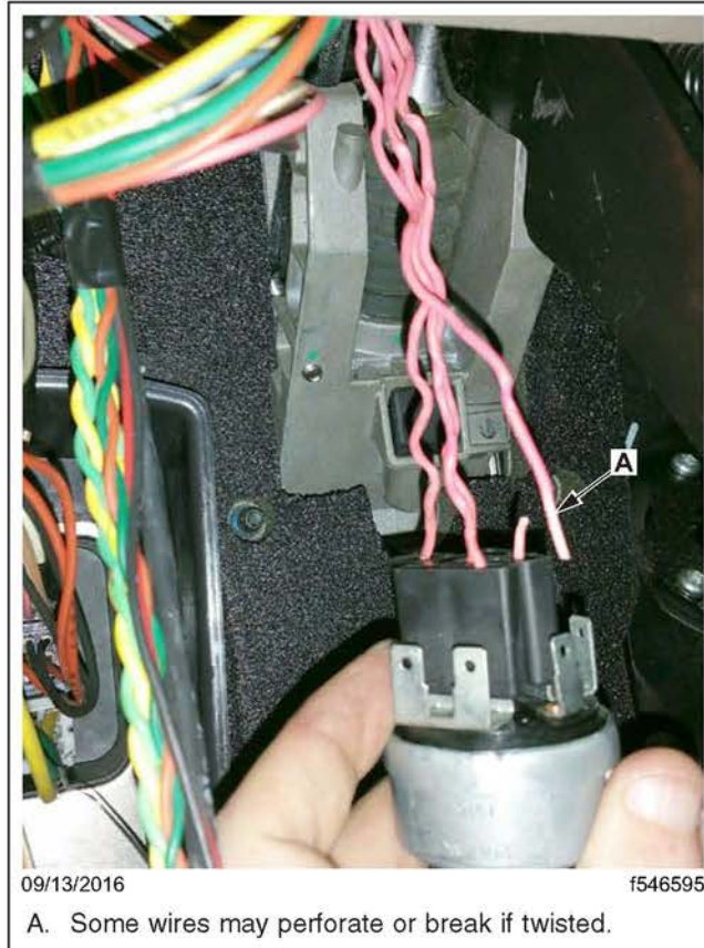
Fig. 2, Twisted Ignition Switch Wires

122SD and Coronado Business Class M2 > Cascadia 108SD/114SD