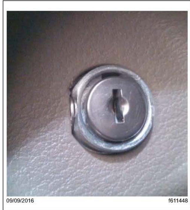
Fig. 5, Washer Fully Seated in the Ignition Switch Housing