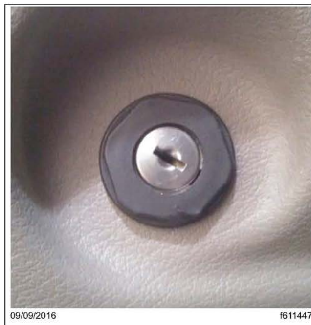
Fig. 1, Ignition Switch Housing Rotated Out of Position