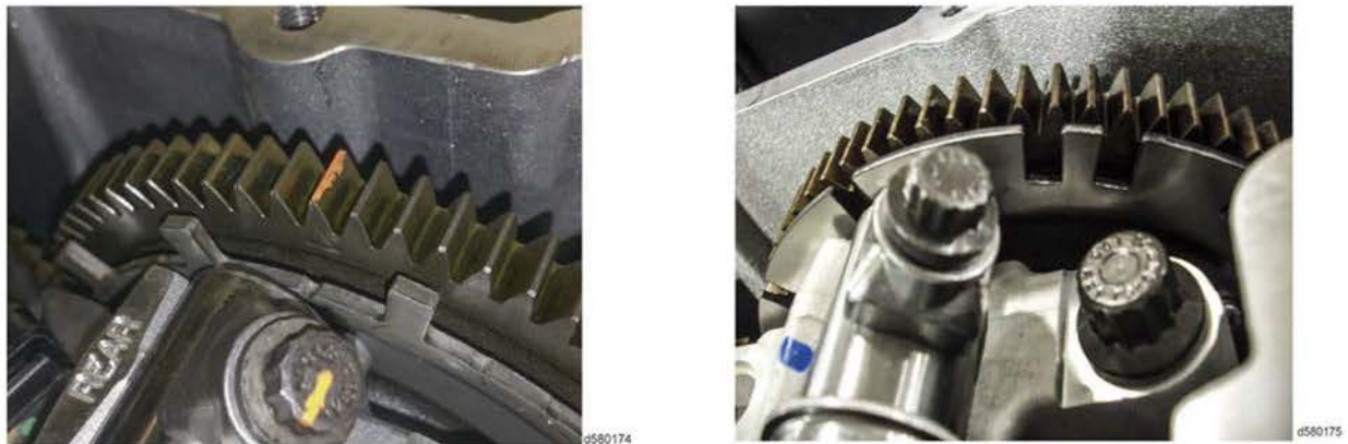
Figure 1. New intake camshaft tone wheel (left) and old tone wheel (right)

The easiest way to identify an engine with the new camshafts and idler gears is by inspecting the intake camshaft tone wheel. The new tone wheel has individual fingers. The old tone wheel is more of a plate style with cutouts. See illustrations below.