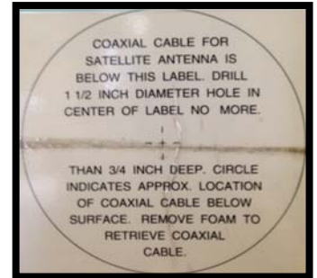
Label to be removed

Attached to this letter is a list of subject vehicles which were shipped to your dealership. Customers with affected vehicles are being sent a letter notifying them of the service campaign. These owners are being directed to remove the label or to contact a Winnebago Industries dealer for the service campaign to be performed at no cost to them. A copy of the owner notice is provided for your information.