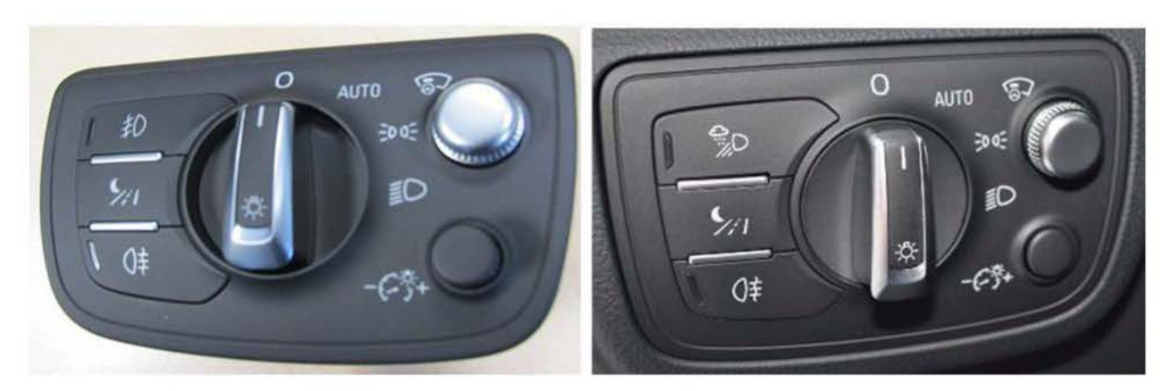
Figure 3. A6 and A7 headlight switch knob pushed in (left) and in normal position (right).