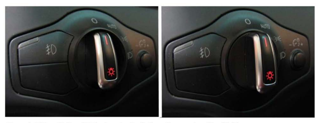
Figure 1. B8 headlight switch knob pushed in (left) and in normal position (right).

The headlight switch knob was designed with a normal position and a pushed-in position (Figure 1, Figure 2, and Figure 3). This feature was designed to avoid injuries during a collision.