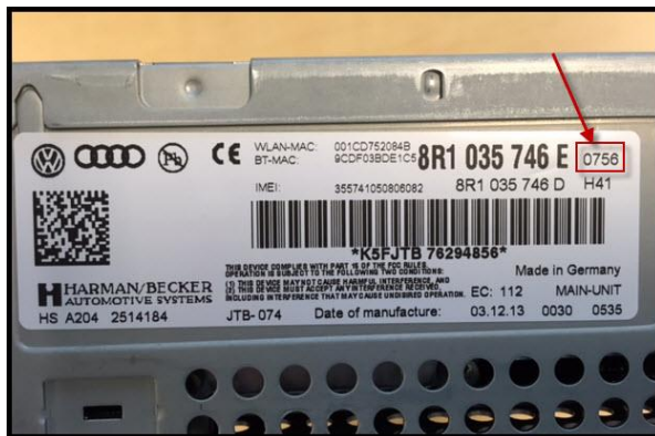
Figure 3. Main unit part label.