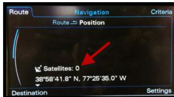
Figure 1. No satellite reception.